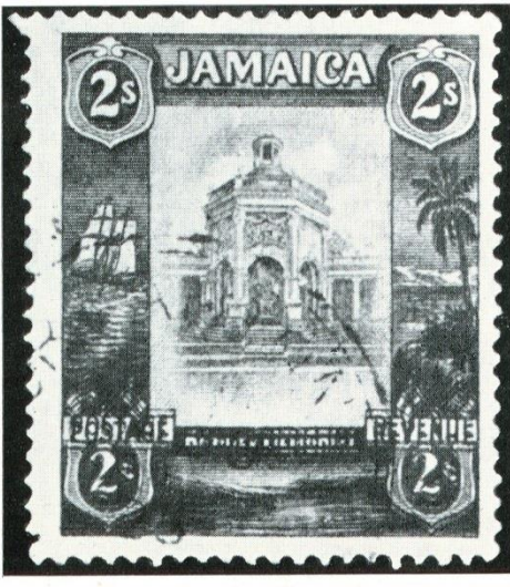
Lot 349 The rarest West Indian error.

At the Auction Rooms of Robson Lowe Ltd. 50 Pall Mall, London, ABBEY 4034-5 S.W.1