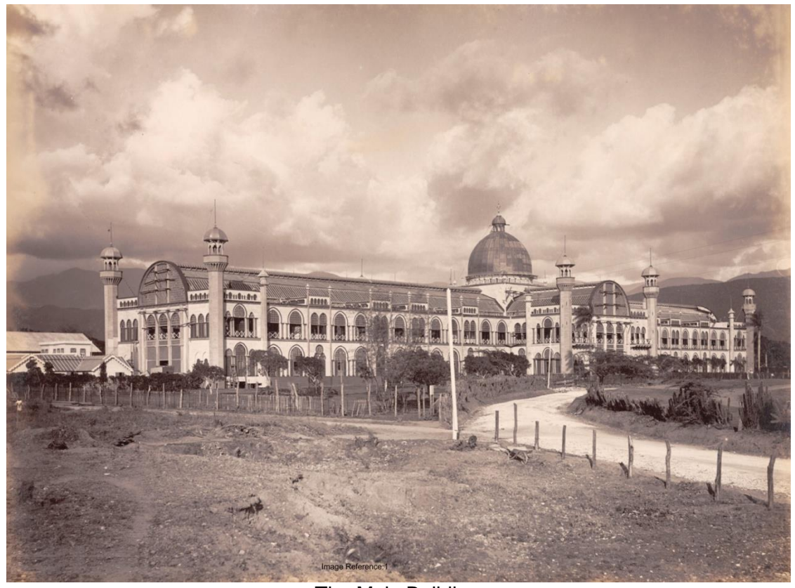
The Main Building